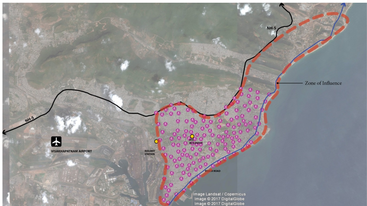
Figure 1: Zone of Influence of the Public Bike Sharing (PBS) System

Zone of influence area – in addition to the PBS planning study area, the authority has identified a “zone of Influence” for the Public Bike Sharing System. This zone provides an indicative catchment area (outside the 18 sq.km area) that has the potential for a functional PBS. This zone includes major tourist destinations, educational institutes, and prominent areas along the Beach Road etc. The purpose of identifying such an area is to provide flexibility to the service provider in case there is a need to re-allocate/re-locate the station locations identified as part of the planning study (as an alternative to indicative station locations suggested in the planning study or expand the PBS system beyond the 18 sq. km area). The service provider may recommend to GVCCL about the extended PBS potential for the City within the suggested 800 cycles proposed for the PBS system in Vizag Smart City.